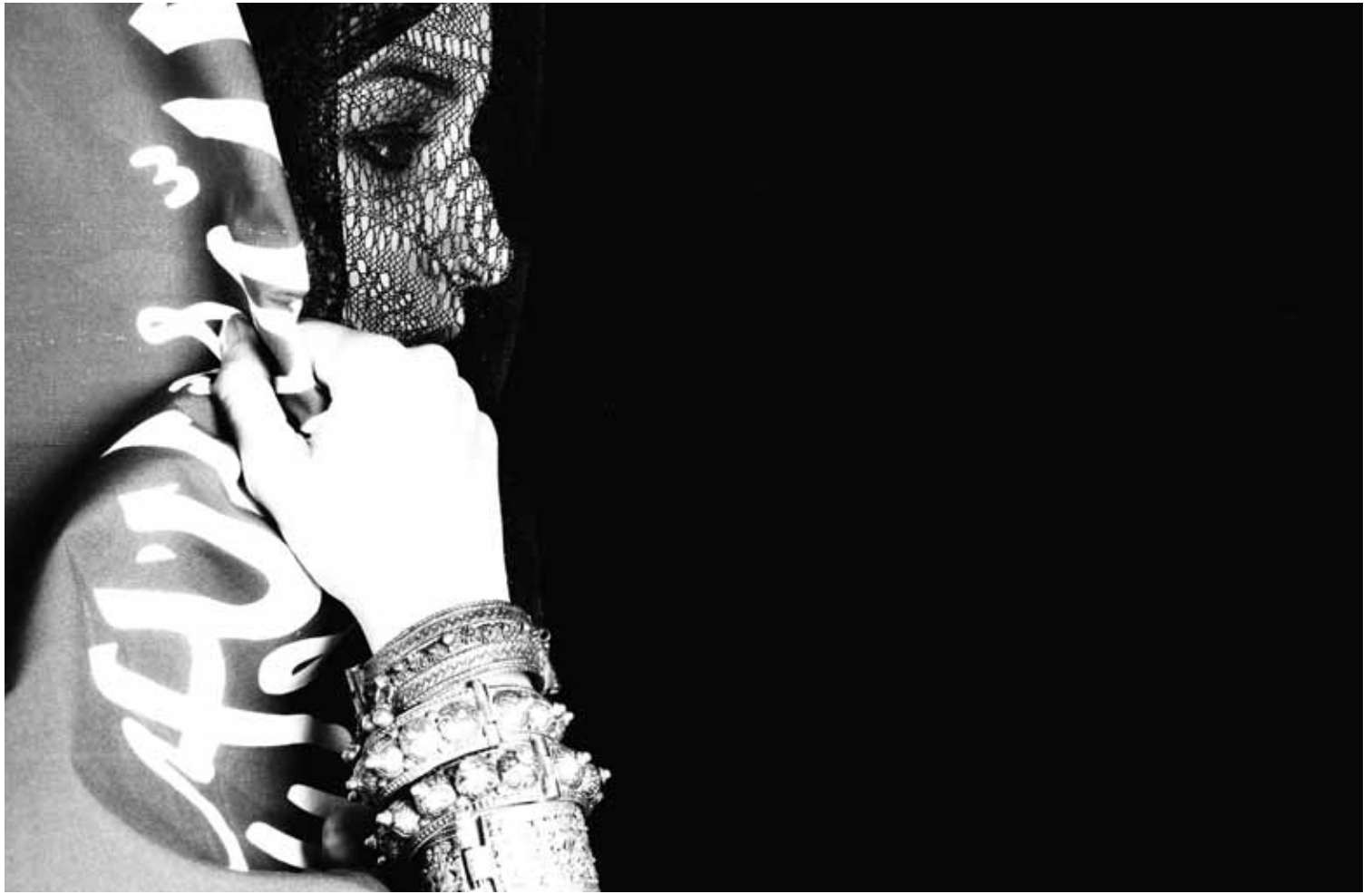
From the series I am by Manal Al Dowayan